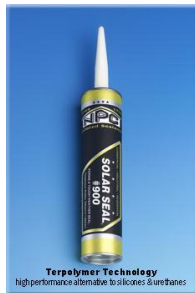
Terpolymer Technology high performance alternative to silicones & urethanes