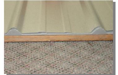
OUTER CLOSURE STRIP